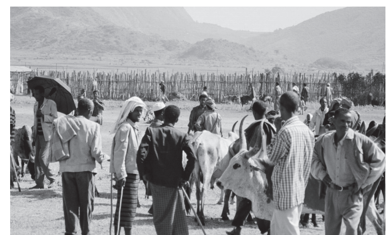
The Kemise Cattle Market, Ethiopia.

Humanitarian versus Long Term Development Assistance. We provide evidence as to how aid donors might improve the effectiveness of their programs for this region, illustrate how the tension between short-term humanitarian and long-term